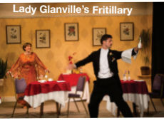
Lady Glanville's Fritillary