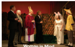
Woman in Mind