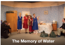
The Memory of Water