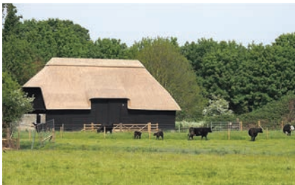
Landbeach Tithe Barn

Landbeach tithe barn has come a long way in the last 12 months - from a state of near collapse to a structure fit for use by the community for many years to come. By installing these toilets, we will be moving even closer to the goal of not just saving the barn but ensuring its future as a vibrant, popular, friendly space for all to enjoy.