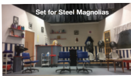
Set for Steel Magnolias