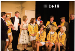
Hi De Hi