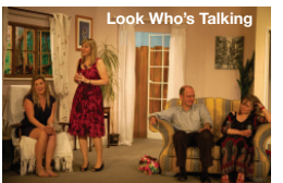
Look Who's Talking