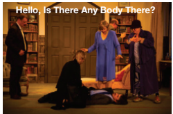
Hello, Is There Any Body There?