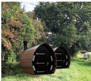
Kazuboo in position - artist's impression

To make this a reality, local group the Tithe Barn Trust is launching the 'Spend a Penny' campaign to raise the £30,000 needed to purchase and install two remarkable, eco-friendly toilets. The Kazubaloo doesn't require any water, electricity or chemicals. They are self-contained, easy to maintain and look good, which makes them ideal for the Barn and its future uses. The barn is around 500 years old and a penny spent in the year 1500 (when Henry VII was king) is the equivalent of over £5 today so we are asking our members, supporters and the community to donate a minimum of £5 each to enable the installation of these high quality environmentally-friendly loos.