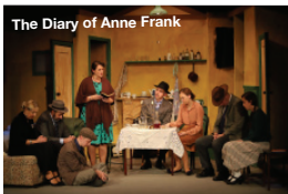
The Diary of Anne Frank